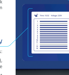
Modern and user-friendly graphic display